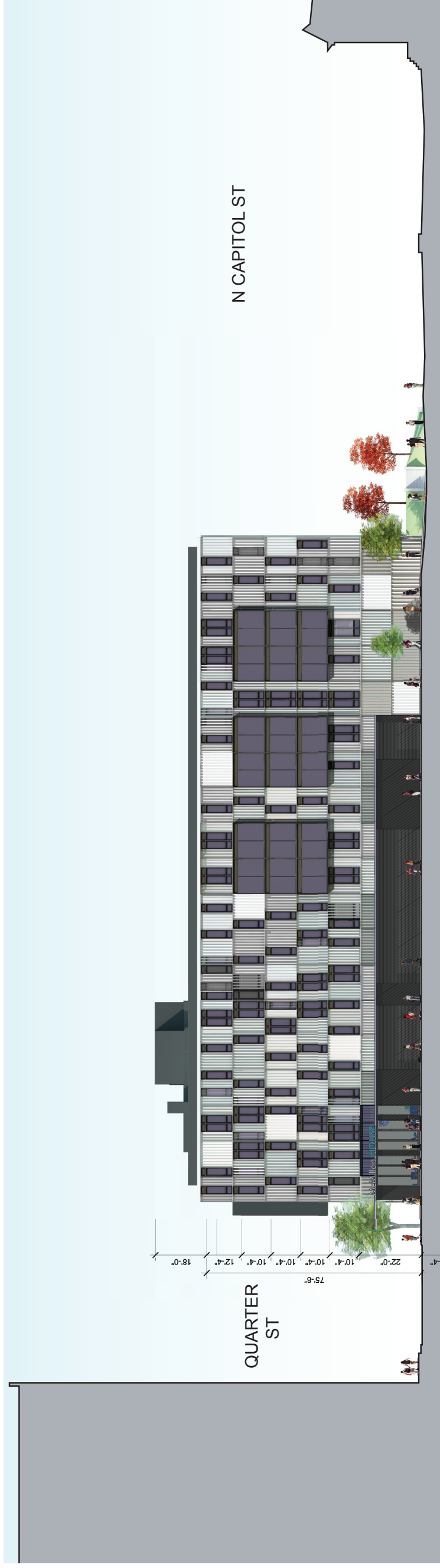
① SOUTH ELEVATION