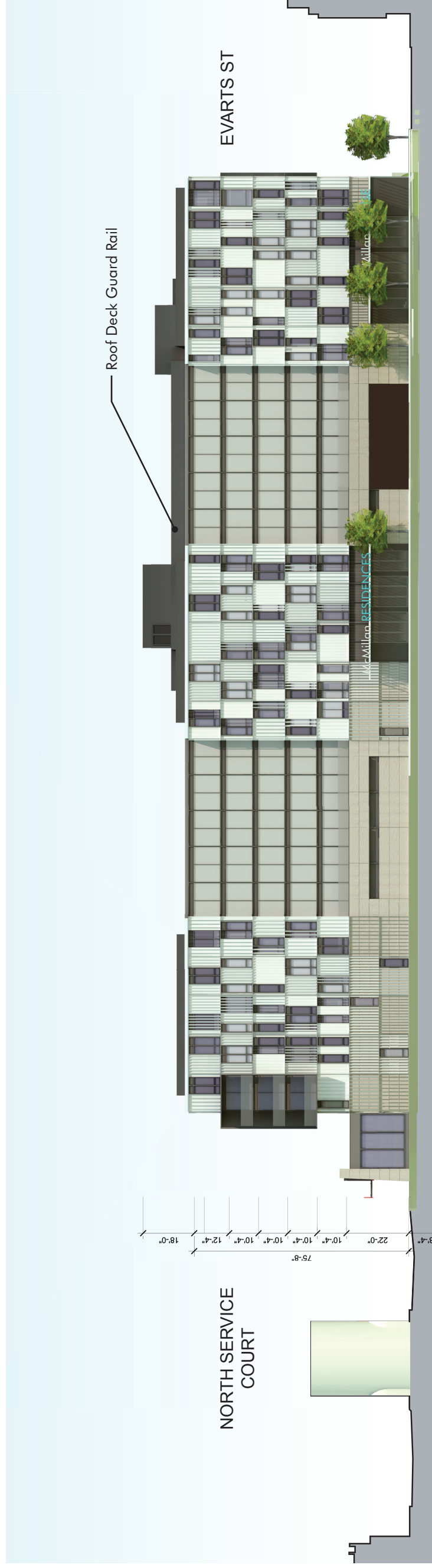
② WEST ELEVATION